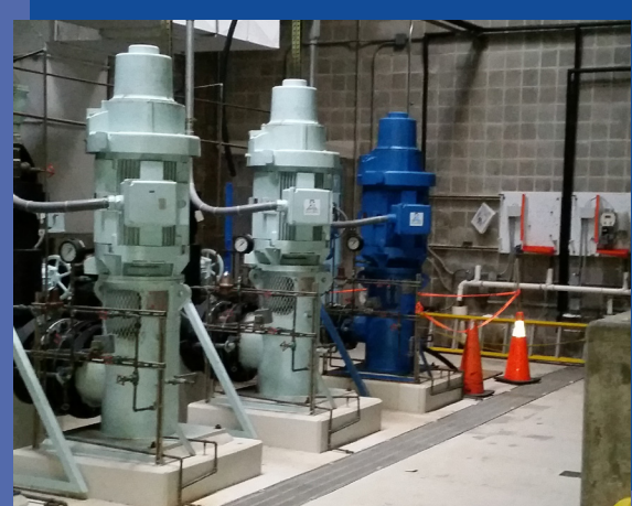
The pump room at the Greater Augusta Utility District's unused Gerard F. Laurin Water Treatment Plant in East Winthrop.

GAUD built the East Winthrop plant, also called the Gerald F. Laurin Water Filtration Plant, in 1992 to treat water from nearby Carleton Pond for use in the public drinking water system. But when the former Kirschner hot dog plant, a major water user, closed, the District saw a major drop in water demand, and found cheaper ways to provide water. The plant had since served only as a back-up water source,