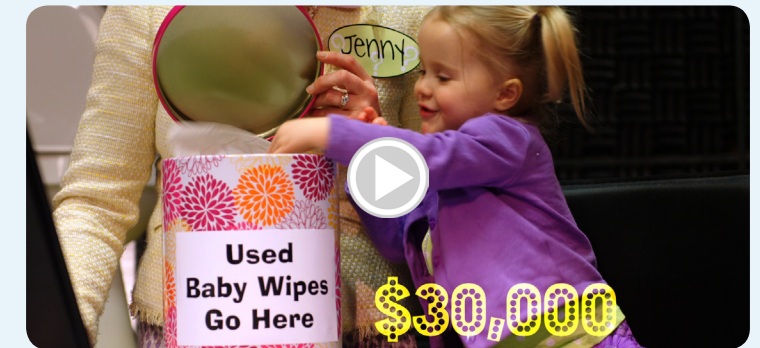
Visit SaveYourPipes.org to view TV spots featuring a retro game show, "What the Flush?!", and other materials designed to persuade people not to flush baby wipes.

So do yourself and your community a favor: don't ever flush baby wipes! You'll both prevent costly repairs to your home plumbing, and help keep sewer rates down.